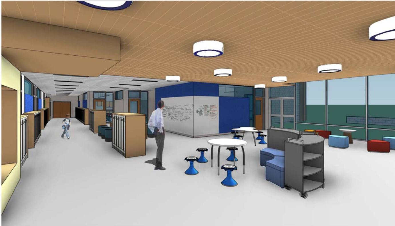
FIRST FLOOR BREAKOUT AREA – SCHOOL B (LOOKING OUT)