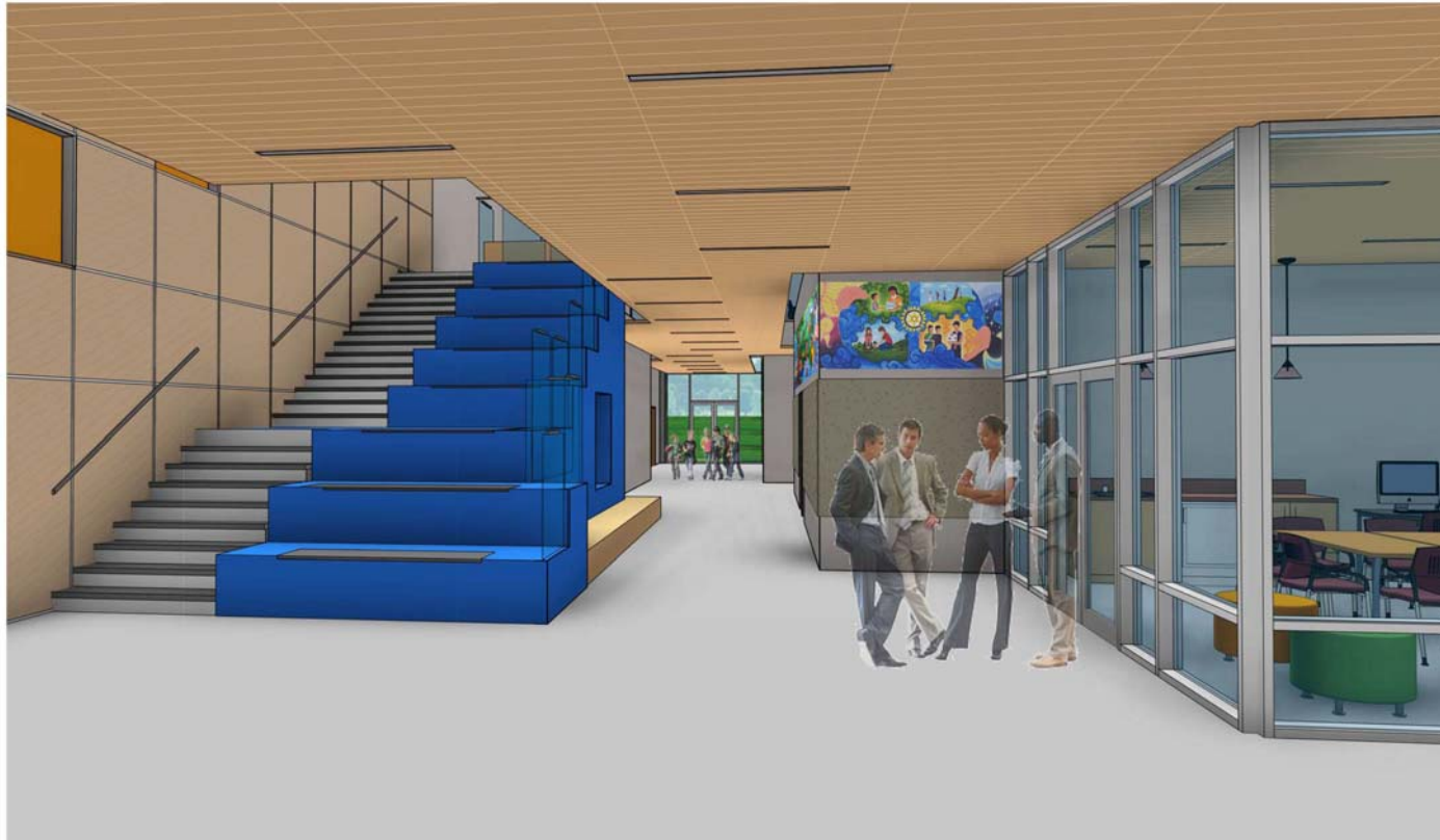
MAIN STAIR – SCHOOL B