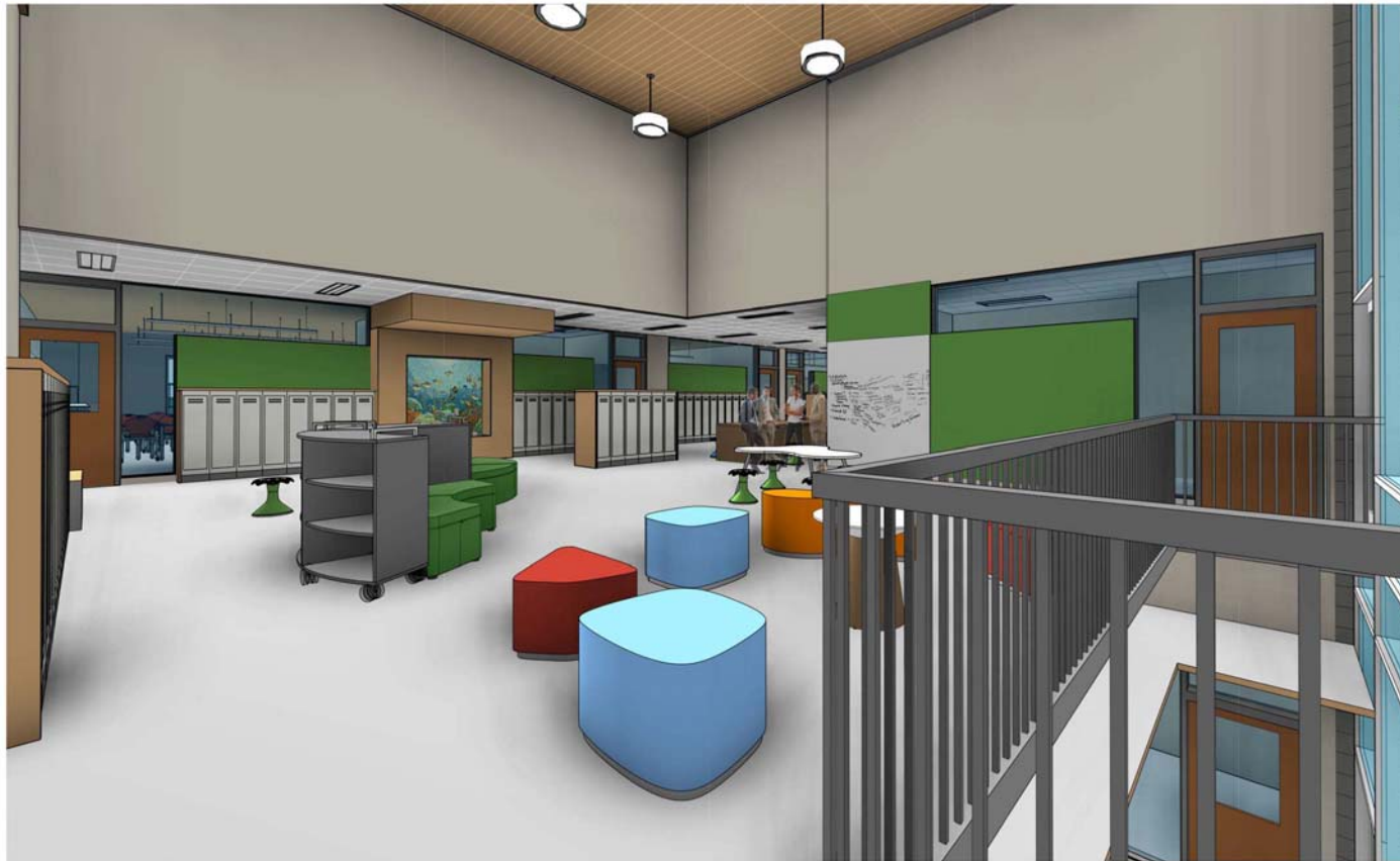
SECOND FLOOR BREAKOUT AREA – SCHOOL A (LOOKING IN)